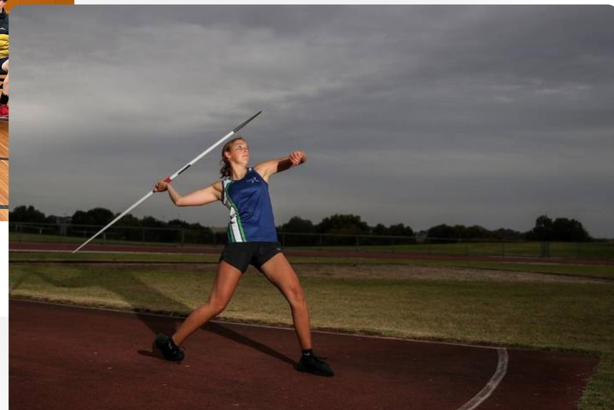
#03 Individual Athletes

SWAS is keen on creating meaningful partnerships. The following pages describe possible partnership opportunities, however we encourage potential partners to discuss their needs.