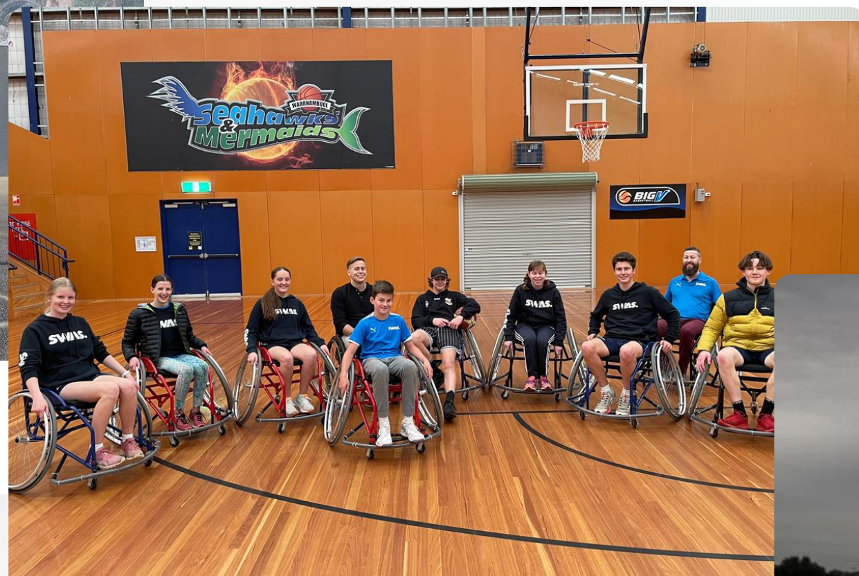
#02 Sport Programs